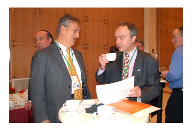
EFES Gala dinner at Euronext - The TOP 100 celebration