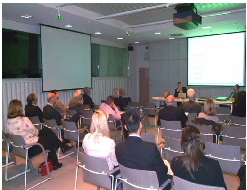
More information on <a href="https://www.monideefinance.com">www.monideefinance.com</a> and restricted demo on <a href="http://www.oursolution.nl/demo/index.asp?subnav=1&id=66">http://www.oursolution.nl/demo/index.asp?subnav=1&id=66</a>