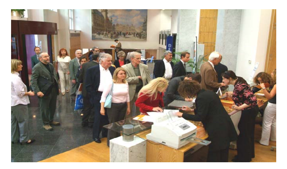
Registration of attendees at the conference desk of the National Bank of Belgium

The Fifth European Meeting of Employee Ownership was held in Brussels on June the 16<sup>th</sup>, 17<sup>th</sup> and 18<sup>th</sup> 2005 in the Auditorium of the National Bank of Belgium. The conference focussed on learning and education. The major event attracted more than 200 participants from more than 26 countries.