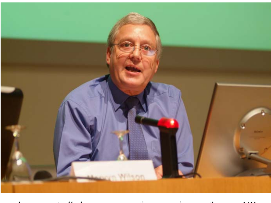
and controlled co-operatives in the UK.

Co-operatives estimate there are approximately 358 worker-owned