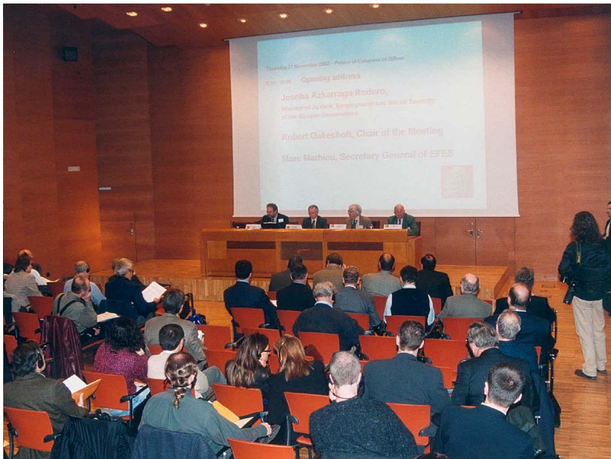
Participants assembled in the room of the Convention centre in Bilbao.

The impact of the representation varies according to the number of shares held. In some ESO associations, the representation is based on a voting right per person and a common strategy. The guiding principle of good practices is an equitable distribution for all.